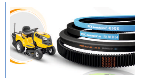
Lawn Mover Belts