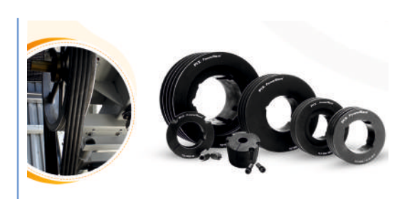
Pulleys & Bushes